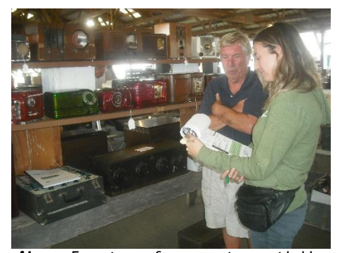
Above: Easy sign up for next spring provided by friendly Renningers roving representative.

The DVHRC is extremely proud to partner with Renningers and the success of our Kutztown Radio Meet series is a tribute to a lot of hard work together. Renningers manages a unique venue with lots of space in an outdoor open market format with most safely under cover. There is a lot of promotion, logistics, and event management services provided by the Renningers staff.