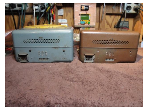
The radio has some interesting features.