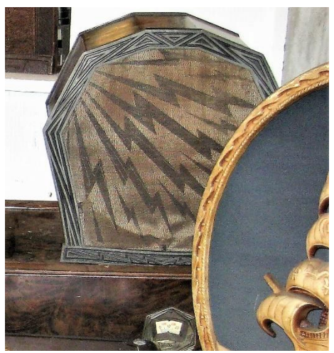
Above: Some beautiful grill cloth was seen at recent Kutztown 39 display in September.