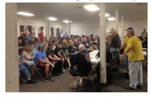
Spring 2019 will be special-Kutztown XL (our 40<sup>th</sup>)! Stay tuned for further information!