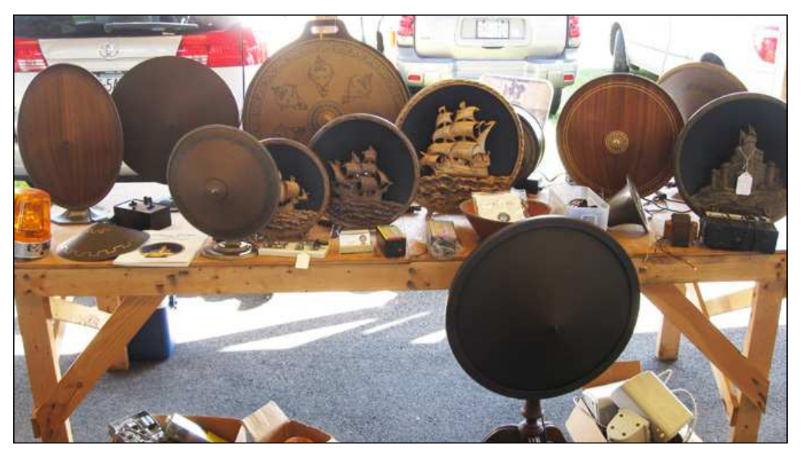
The Chidester speaker table

testers, or anything else, and the pavilions are well lit from Friday to Saturday, including all night on Friday. Third, anyone can just come in and browse, because there is no charge to attend (dealers pay for their tables and that's it!). Fourth, you can camp out in the field adjacent to the pavilions and there are showers inside the main building for those who want to make use of them (I found that most people don't know about this). As an added bonus, you get the charm of a small town, decent hotels in the area and a farmers market and flea market on Saturday.