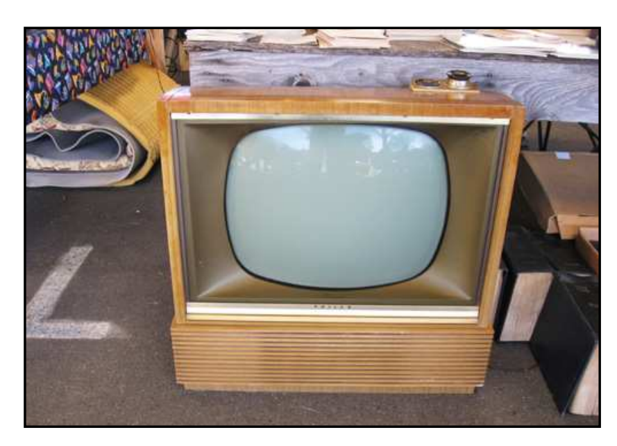
Philco Predicta TV