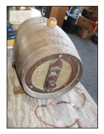
The Radio Keg radio