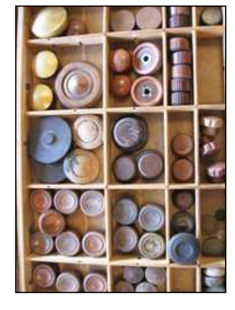
Gobs of knobs