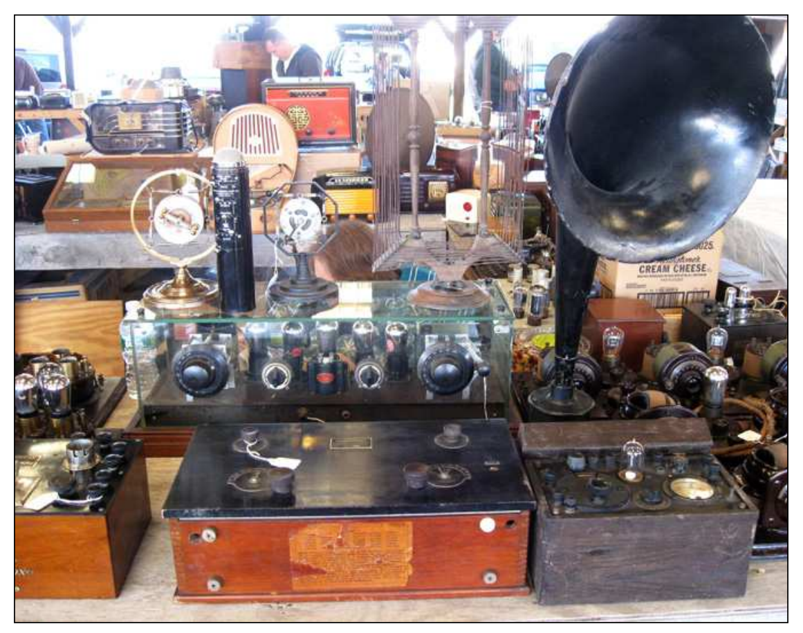
A collection of battery sets